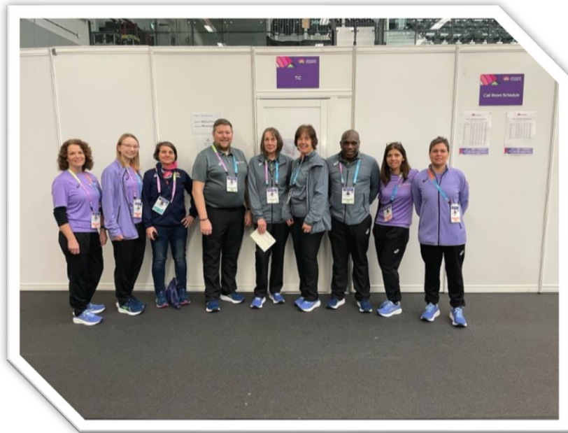
The TIC Team