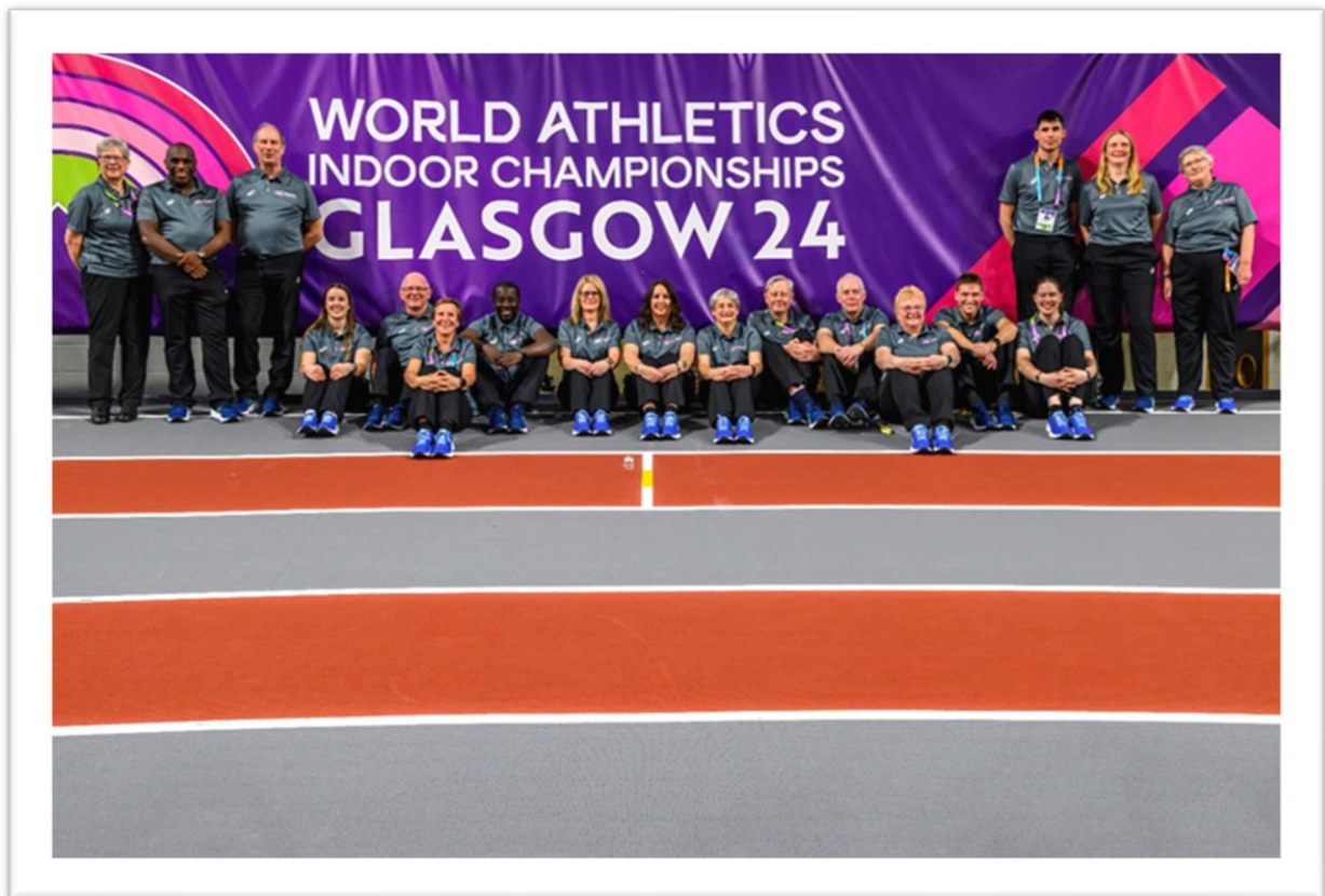
The appointed officials from the Midlands for Glasgow 2024

World Athletics and Competition Management were pleased with how the competition went, and the athletes and their support staff enjoyed the event in Glasgow.